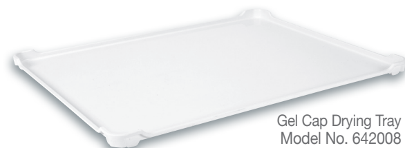
Gel Cap Drying Tray Model No. 642008