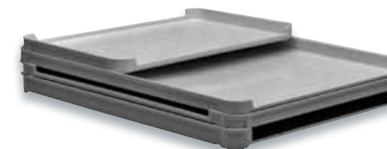
Stacking Ventilation Trays with drop sides Model No. 805208 and 805308