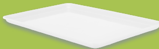
Stacking Drying Tray with Drop Ends and Sides Model No. 642008